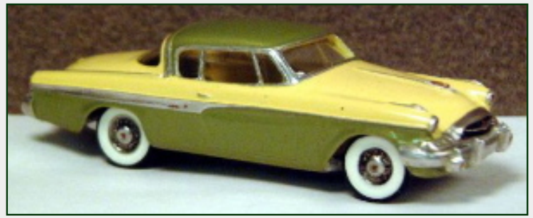
1955 President Speedster